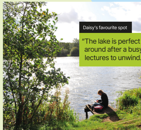
Daisy's favourite spot "The lake is perfect to walk around after a busy day of lectures to unwind."