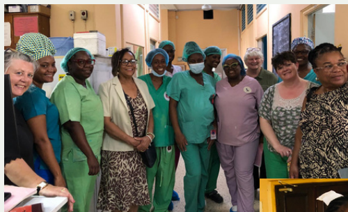
University Hospital of the West Indies (Maternity)

However, when we visited the neonatal intensive care unit, at the central maternal health hospital, this was full and very busy, as it took regional referrals, as well as local admissions. Discussion often turned to the impact of climate change on maternal and child health, particularly associated with water safety and access to nutrition.