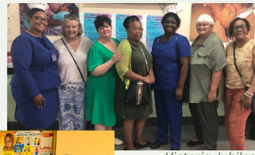
Victoria Jubilee Hospital (Maternity)