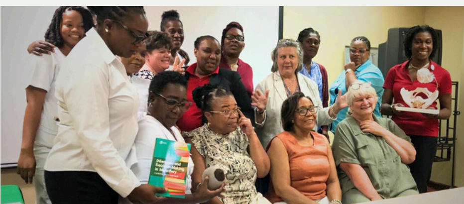
UWI MONA workshop and gift donations: 27 May 2024

The CNMA/UEA team achieved two workshops. One at the start of the week focused on Perinatal Mental Health, and a second at the close of the week's visit explored Leadership and Coaching. The UEA team also signed their co-authored textbook (Dilemmas and Decision Making in Midwifery: A Practice-based Approach. Critical Publishing 2023).