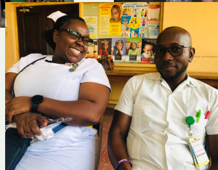
Bellevue Hospital (Mental Health Facility)

In collaboration with UWI staff, and based on our clinical site observations the visit identified potential for 15 actions as ongoing projects.