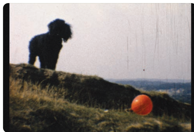
Balloon Adventure (c1970s, Philippa Miller, East Anglian Film Archive).

Once data are located, you will need to triangulate and gauge the reliability of comparable information (donor questionnaire, film credits, newspaper article) to ensure the accuracy of your new metadata.