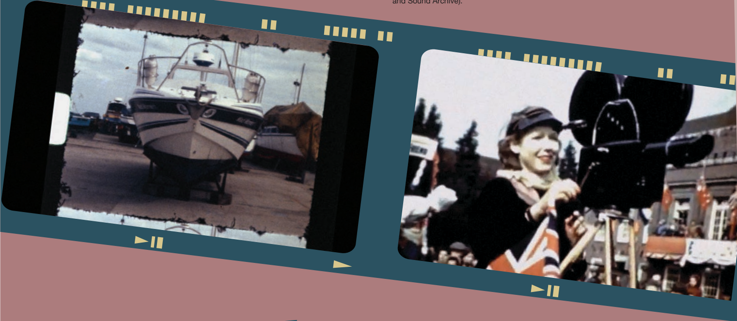
Left: High and Dry (1970s, Joan Hammond, East Anglian Film Archive). Right: Historical research revealed the significant contributions of women to club productions and allowed the creation of new bibliographical entries within the collections record. Royal Day (1953, High Wycombe Film Society, Wessex Film and Sound Archive).

In one case, we worked with a collection comprised of over 150 films produced by a British amateur cine club between the 1940s and early-2000s whose activities were reported regularly in the amateur film journals. The collection was donated to a regional archive along with documentation largely consisting of shot lists for each title. The specific contributions of women could only be identified through on-screen credits reproduced verbatim in the shot lists and through the free-text description field. In this instance, there was no option to use agent records in the CMS. Subsequent historical research into the cine club (see Tool 5: Using Other Research Resources ) revealed additional biographical and filmographic data linked to several key women filmmakers previously identified in the film credits.