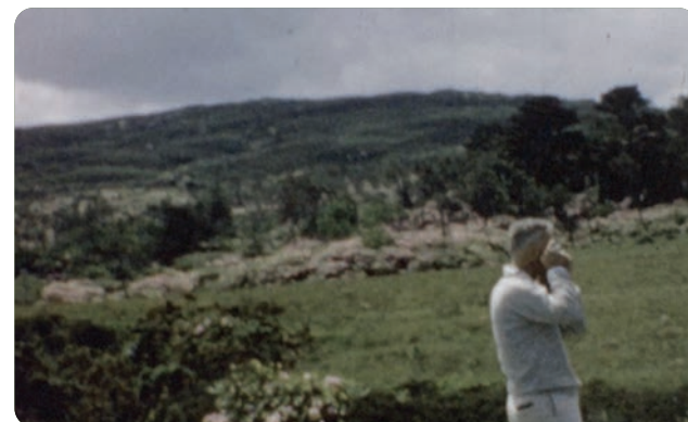
It can be useful to look at how shots are framed even in home movies in order to get a sense of a filmmaker's style and creative practice. Agnes Heron's 'Roll 21: Achill', 1969.