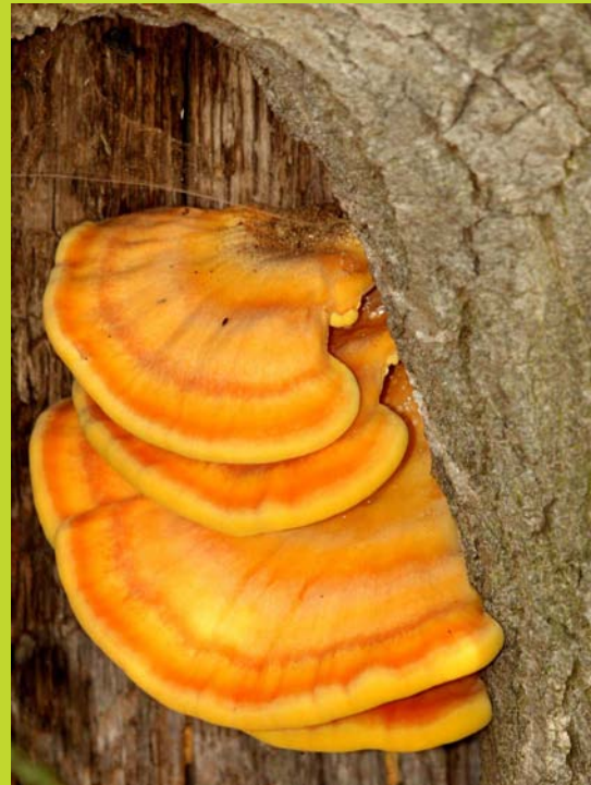
Chicken of the Wood Fungi Laetiporus sulphureus at Heartwood Forest on 25 July 2011.