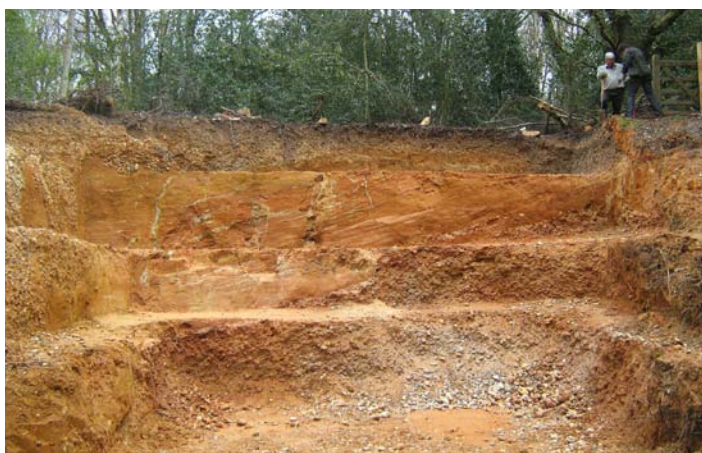
The site at Little Heath.

The new excavation confirmed the sequence of deposits recorded earlier, though the uppermost deposit, the Devensian silty clay gravel (bed 8) of Moffat and Catt, previously described as 'glacial' gravel by Gilbert (1919), was found to thicken rapidly westwards, forming large involutions into the underlying intertidal sands (bed 7). The beach gravels (bed 6), which underlie the intertidal sands, contain small white quartz or quartzite pebbles, which were sampled throughout the 5-6 metres of gravel. We hope to date these using the new method of cosmogenic nuclide burial dating, in order to obtain a more precise estimate of the time when the sea lapped onto lower parts of the Chilterns. At present the unfossiliferous beach gravels and intertidal sands at Little Heath are tentatively correlated with the sandy ironstone containing Red Crag fossils found in 1926 at Rothamsted near Harpenden (Dines and Chatwin, 1930), and thus with the Red Crag of East Anglia, which is about 2.6 million years old (i.e. late Pliocene or early Pleistocene). The differences in height of