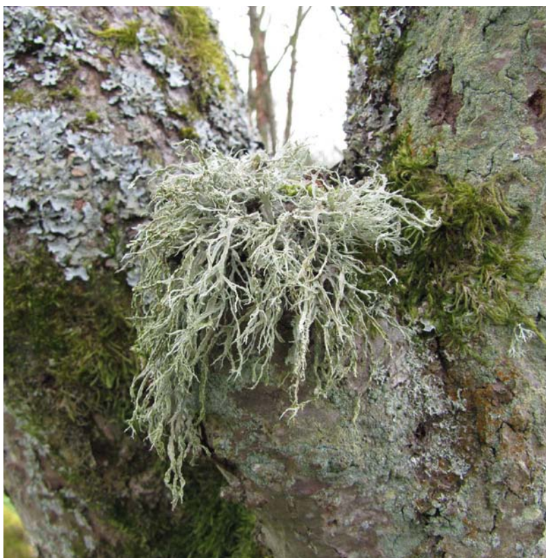
Ramalina farinacea at Tewin.

Porina aenea appears to occur in two forms which are often clumped together and treated as a single taxon. Specimens from smooth bark with prominent perithecia and a K- involucrellum are well-named as P. aenea . The larger, semi-immersed perithecia with a K+ blue-grey pigment, which are found rather frequently on old bark (often close to the bases of tree trunks), may be Porina byssophila which is generally considered to be a saxicolous species. Such material is