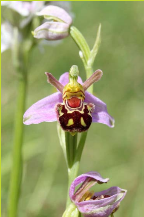
Bee Orchid at Weston Hills on 1 July 2012.