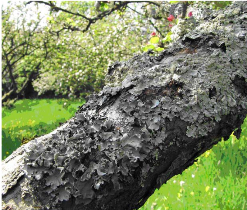
Parmotrema perlatum and Flavoparmelia caperata at Stanley Lord Orchard Shenley Park.

It is not only the fruit trees that support lichen communities in orchards. Non-fruiting trees and shrubs, old buildings, neglected machinery, gates and fences all have the potential to add to the lichen diversity of a site, reflecting past or current management of sites. These – as the UK BAP states – reflect the range of ecological niches present and demonstrate a holistic approach is valuable when considering the full biodiversity interest of traditional orchard sites.