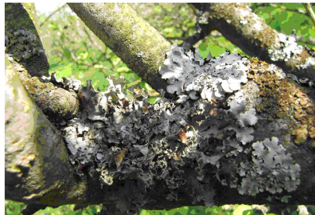
A variety of foliose lichens on apple bough at Stanley Lord Orchard, Shenley Park.

more orchard sites representing the most characteristic communities. The average number of lichen species on fruit trees for each site as 34, and from each site as a whole was 49 species. 69% of species records came from fruit trees, demonstrating both the importance of this habitat as well as additional habitat opportunities within an orchard. All species were relatively common in a national context, the lack of rare species being a reflection of historic pollution and the relatively young age of fruit trees compared to veteran trees. However, orchards clearly support good, diverse lichen floras and are of considerable local importance in that respect. The Herts study compares very favourably with other national studies taking past histories and climate factors into account and helps to demonstrate their local value for biodiversity. Suggestions for appropriate management are also provided.