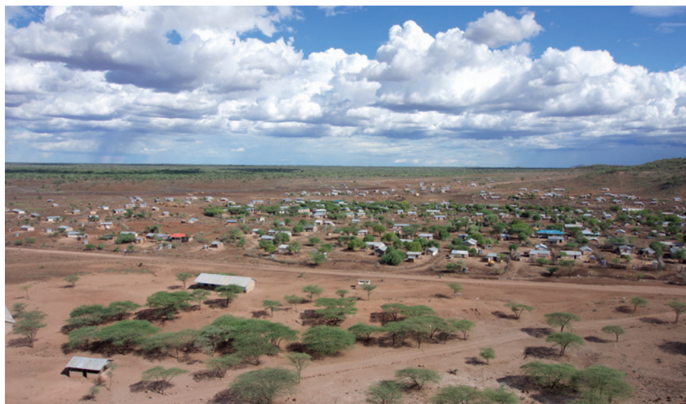
Kulamawe in Isiolo County, Kenya, the location of some of the life course interviews.

uea.ac.uk/devresearch/research-themes/global-environmental-justice/conflict-and-cooperation-over-redd-in-mexico-nepal-and-vietnam