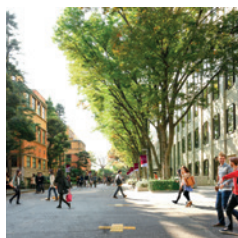
Clockwise from top left: Curtin University, Australia Victoria University of Wellington, New Zealand Sophia University, Japan Ritsumeikan University, Japan

Next academic year sees the start of a new Study Abroad programme in DEV. Under this programme, undergraduate students spend the third year of their degree studying international development and related subjects at a partner university abroad, before returning to UEA to complete the final year of their degree. Studying abroad can be a very rewarding experience, exposing students to new perspectives on important issues, and helping to broaden their horizons and challenge their thinking.