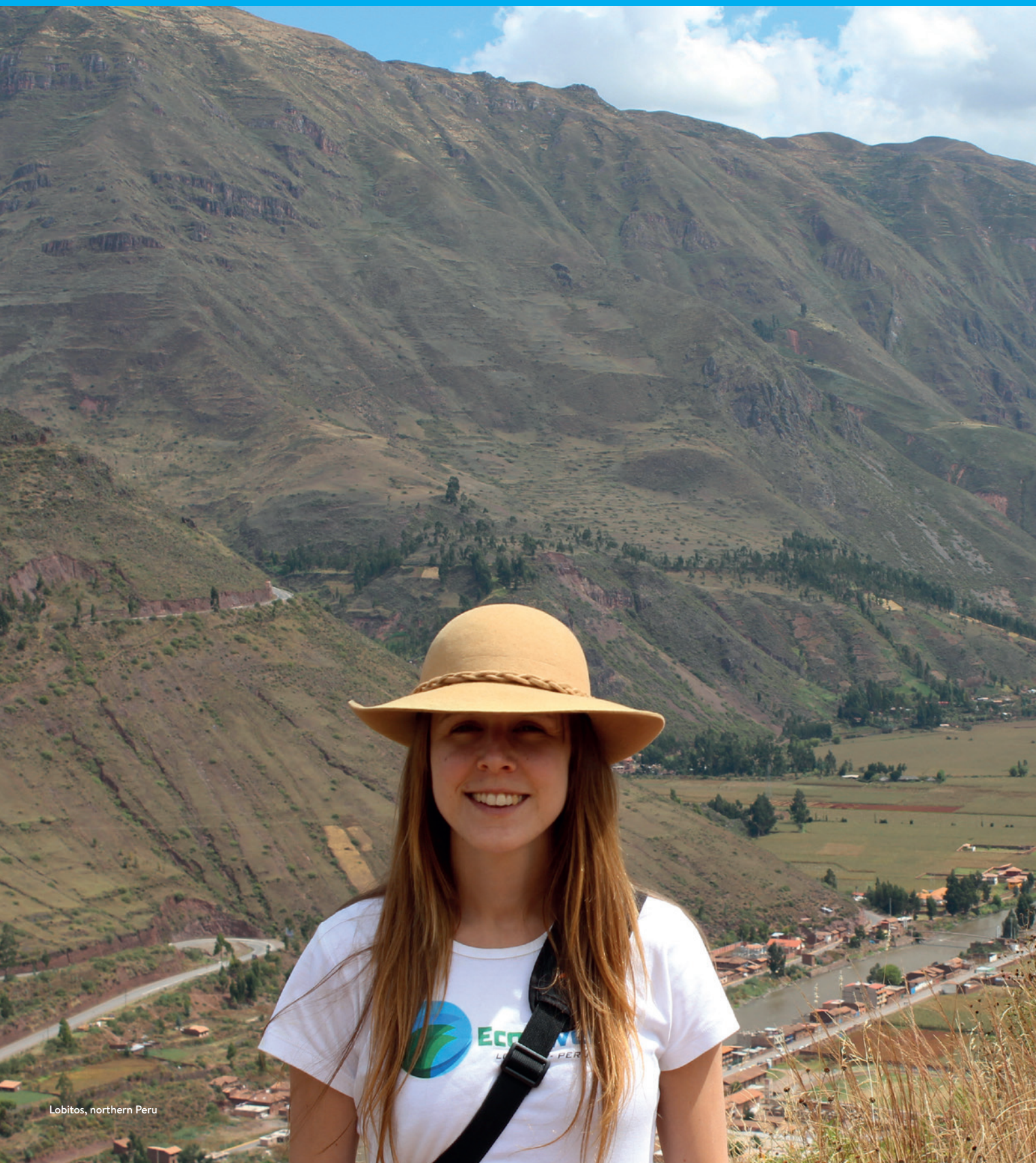
Lobitos, northern Peru