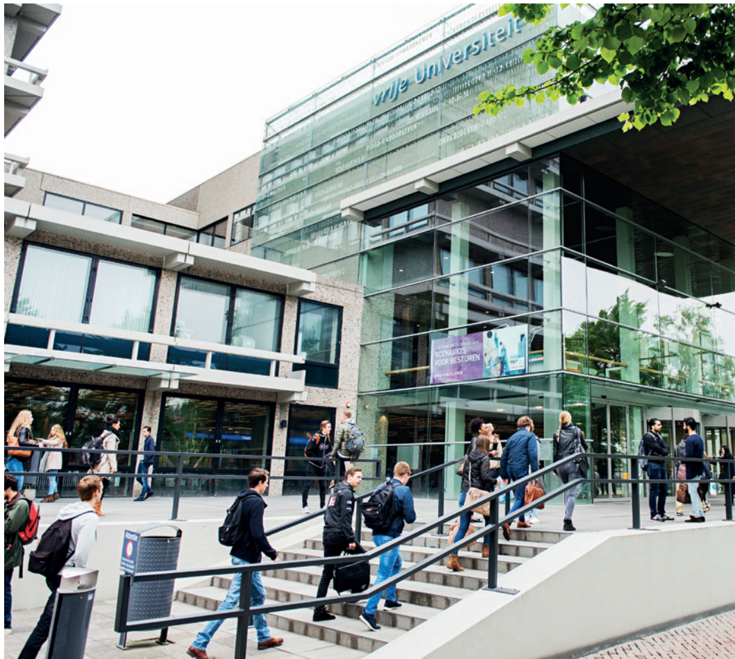
Vrije Universiteit, The Netherlands