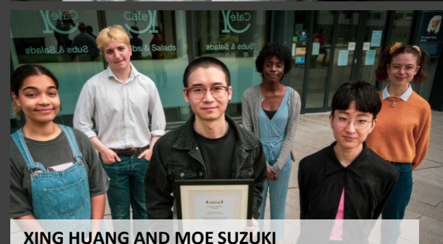
(PPL, front centre and right) Anti-racism and decolonisation in academia