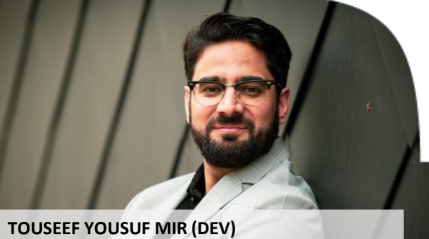
Pe'nd Online: Creating a dialogue on issues affecting Kashmir